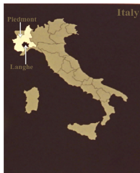
Fig. 1. Langhe map.

This paper uses the Italian wine region of Langhe as case study to examine how winery owners' social identities affect their resistance to tourism diversification. Langhe , situated in the southern part of the Piedmont region (see Fig. 1), has been recognised for its long-standing tradition in winemaking, its interaction with the environment and the aesthetic qualities of the area. The region secured its reputation during the early 1990s when Barolo was recognised as 'one of the world's great wines' (Rosso, 2014), which led to an increased interest by tourists – initially from central Europe – in visiting these places of wine